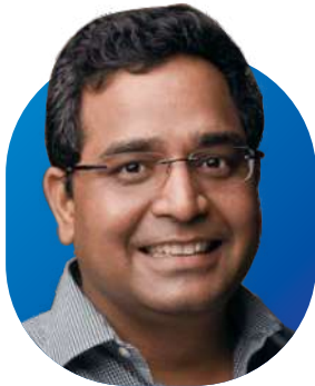
Vijay Shekhar Sharma Founder & CEO