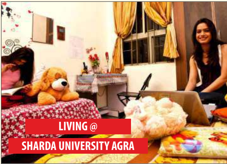
LIVING @ SHARDA UNIVERSITY AGRA

Sharda University Agra offers on-campus hostel accommodation for 1500+ students. The Dining Hall at Sharda Girls Hostel, Vivekananda Hostel & Vijay Swaroop Hostel is a vibrant dining location with options for vegan/vegetarian meals. Additionally, grab-and-go options are located throughout the campus with choices like coffee, smoothies, salads, sandwiches and more.