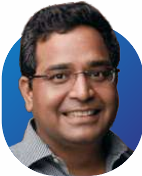
Vijay Shekhar Sharma Founder & CEO